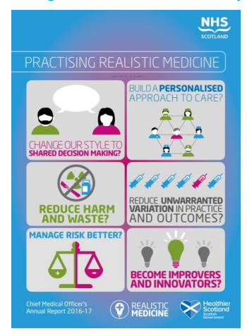
Figure 1: Practising Realistic Medicine - key messages

The value of this approach has been recognised and widely adopted in Scotland. This has been supported by the Chief Medical Officer's annual report 'Realising Realistic Medicine'<sup>1</sup> that proposed 'What matters to you?' conversations within consultations was a fundamental approach to shared decision making. The subsequent year's Chief Medical Officer's annual report, 'Practising Realistic Medicine'<sup>2</sup>, re-emphasised this important question, saying: 'Through shared decision making we must get better at determining what matters most to patients. Practising Realistic Medicine requires care that is coproduced in partnership with the people receiving it – person-centred, holistic care. We need to readdress the balance.' The key messages in this report can be seen in Figure 1 below.