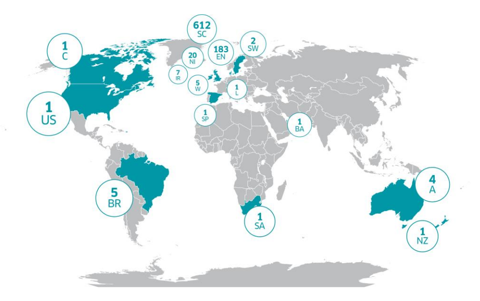
Figure 3: Number of registrations in participating countries